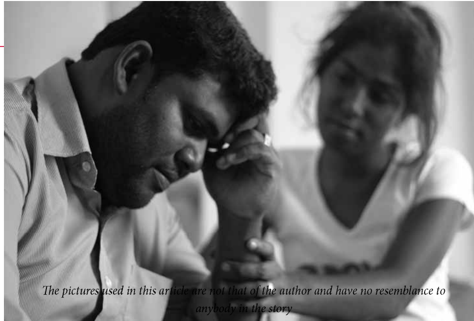
The pictures used in this article are not that of the author and have no resemblance to anybody in the story

MISOGNIST MEN: Men rape women for various reasons. When men gang-rape women, these men bring together with their collective frustrations of life, their delusions about sexuality,